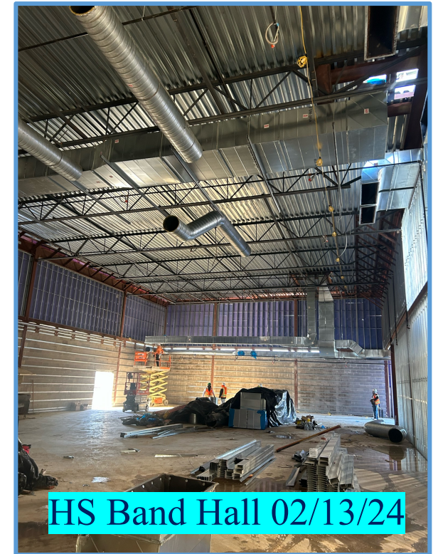
HS Band Hall 02/13/24