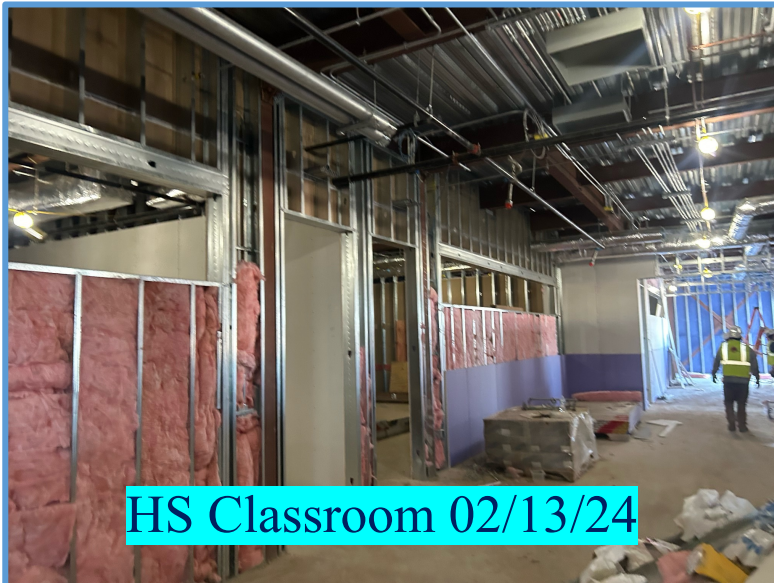
HS Classroom 02/13/24