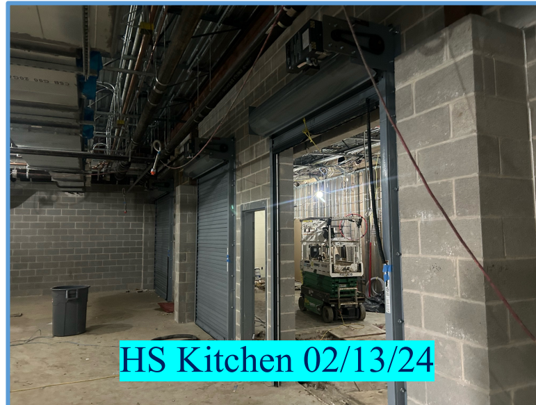
HS Kitchen 02/13/24